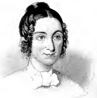
LYDIA HUNTLEY SIGOURNEY. (Page 956.)

land tenure. She is interested in socialism and looks to a conciliation of the seemingly opposing ideas of socialism and individualism into a harmony which may bring about a better state and a happier